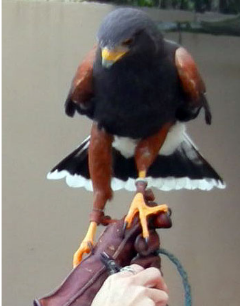
Figure 5. Trimming a hawk's nails on the glove.

We provide a variety of perching options, including natural perches so our birds have opportunities for their nails to wear down naturally. Providing bathing options also helps with nail care. When needed, we trim our hawk, owl and eagle nails while the birds are on the glove. (Figure 5)