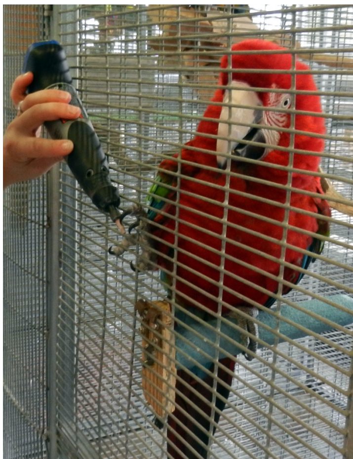
Figure 6. Voluntary nail trip with parrot on designated perch.