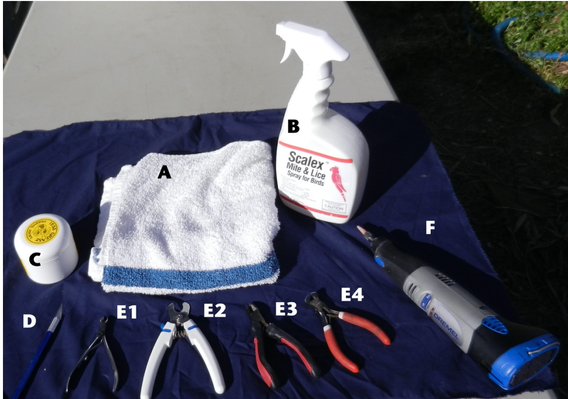
Figure 1. Coping tools. A-towel, B- Scalex®, C- Vitahawk Jess Grease®, D- X-Acto® knife, E- variety of clippers, F- Dremel®.

In preparation for coping, we hold the bird's head in one hand with the first two fingers supporting the back of the head and the tip of the thumb inserted into the mouth to hold the mouth open, being careful to make sure the tongue is comfortably placed under the thumb and the eyes are not being covered by our fingers. (Figure 2) To open the mouth, we gently pull on the skin underneath the bird's beak, which opens the mouth enough for us to then gently insert the tip of the thumb.