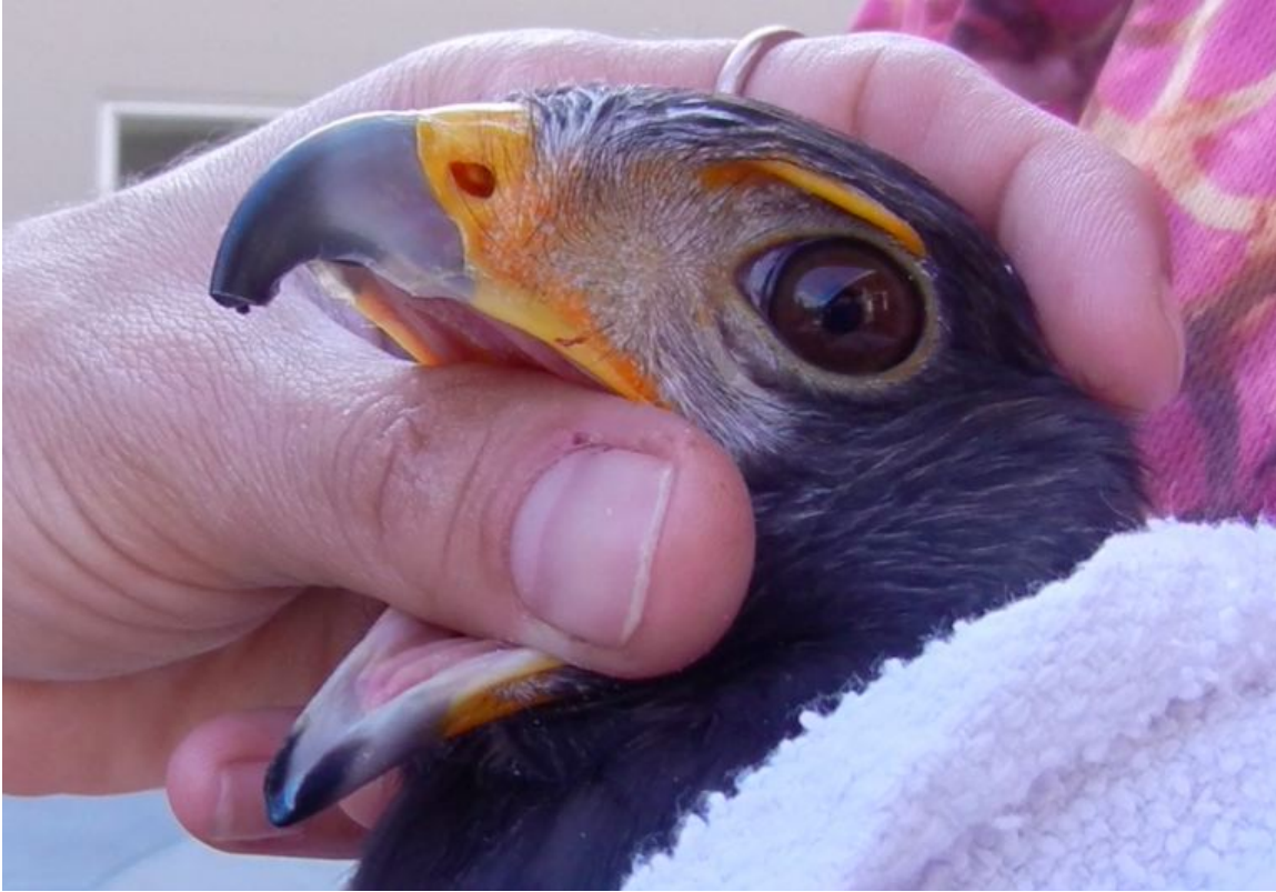
Figure 2. Holding the head.

We then take the clippers with the flat edge and line them up on the side of the beak straight along the line of the beak so about half the clipper surface is on the beak, the other half is not on anything. (Figure 3) Being extremely careful not to cut the cere, we make the cut. When done correctly, the keratin should crack along the curve of the beak. It is important not to cut too deep or too much. We then use the same clippers or smaller cuticle clippers to clip off any pieces that are left attached. We repeat the process on the other side. We then use a cordless Dremel®, being careful to have our hand anchored or leaning on something so the Dremel® does not float in the air but is under control, to smooth the inside edges of the beak. It is important to have the Dremel® steady, as it and the bird's beak will jump slightly when they first make contact. Once the sides are done, we close the beak to clip the tip. We again use the Dremel® to shape and smooth the point of the beak. (Figure 4) The beak should taper to the tip once it passes the mandible and it is important to have symmetry on both sides so the beak grows evenly.