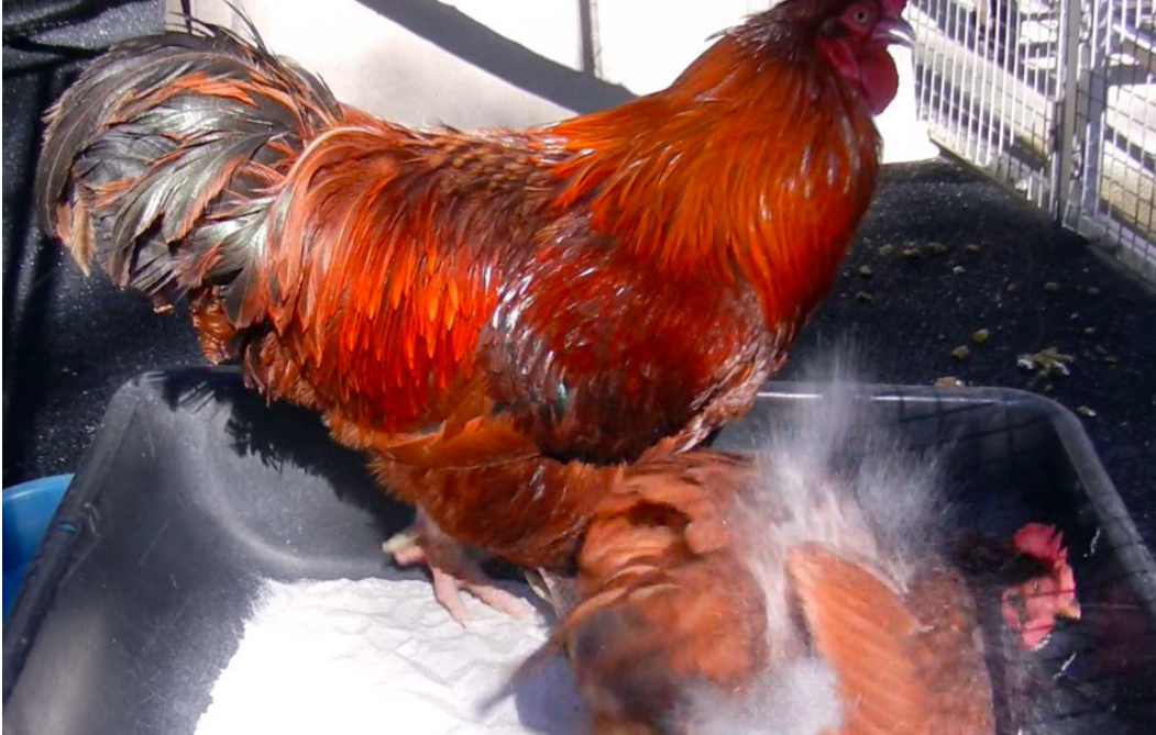
Figure 9. Rhode Island Red chickens enjoying a sand bath.

have access to rain if they choose. This is in addition to a bowl of drinking water. Because our housing does not allow for regular access to rain at our Disney facility, all of our parrots are rotated through our bath cage. This is a large cage with a mister on a portion of it, which allows for the birds to take baths if they choose. (Figure 10)