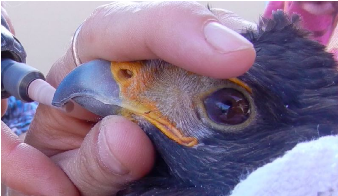
Figure 4. Use the Dremel® to smooth the edges and tip of the beak.