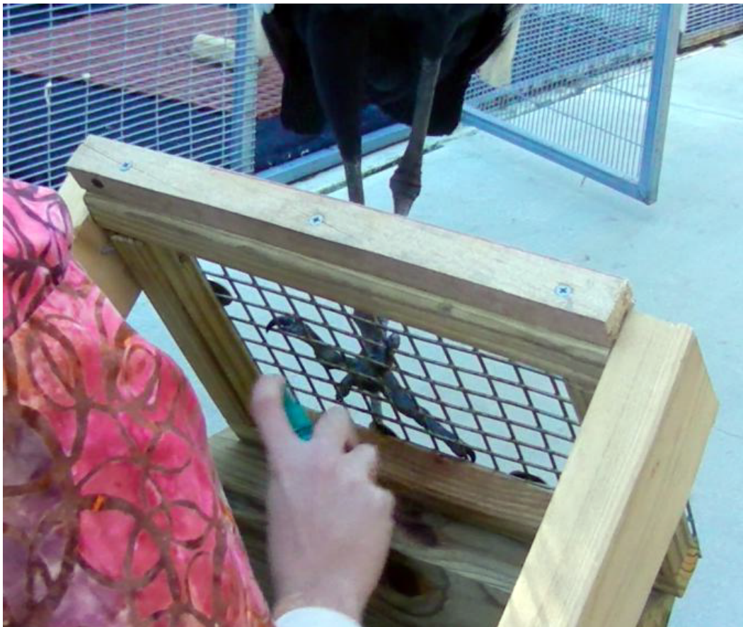
Figure 8. Perch developed to inspect and medicate feet.