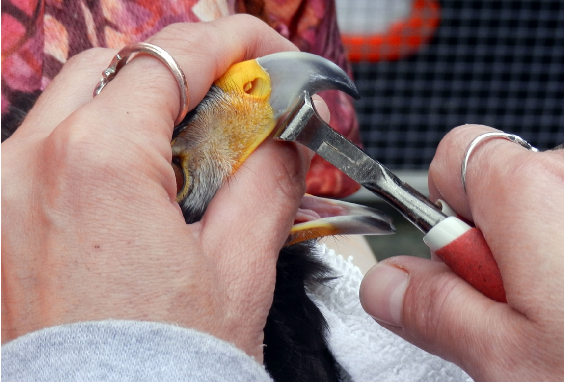
Figure 3. Keeping the mouth open with the thumb, line up the clippers to make the first cut.