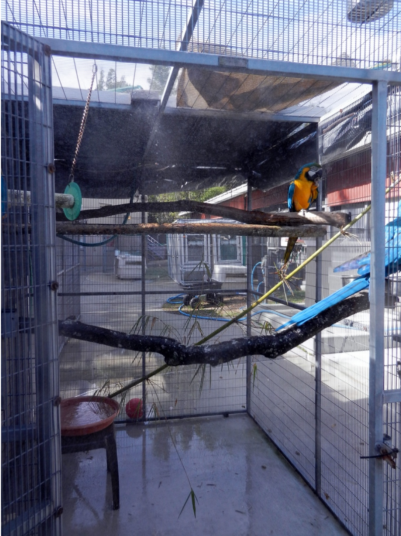
Figure 10. Parrot enjoying a bath in the bath cage.